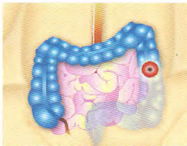
Diagram C of a colostomy with a mucous fistula