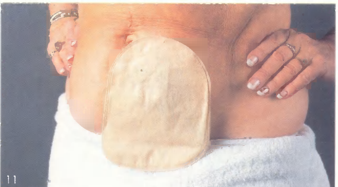
11 Task completed.