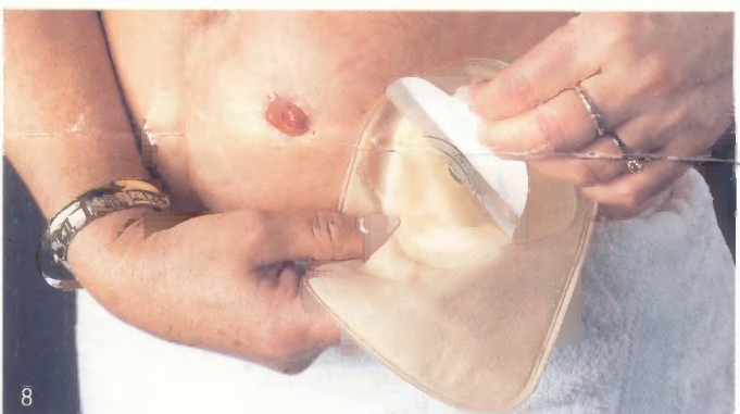
8 Remove the protective covering of the adhesive flange immediately before application.