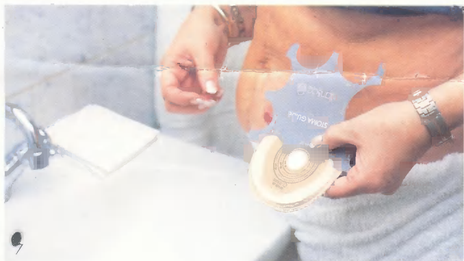
7 Use the stoma guide to check the starter hole of the adhesive flange. If your stoma is uneven or oval, adjust the starter hole with small, sharp scissors. Remember: it is important that the hole fits your stoma snugly without applying any pressure. This prevents redness in the immediate area around your stoma.